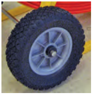
All Terrain Wheels Kit Includes Shaft, Spacers, Wheels, Lock Collars, And Hex Wrench